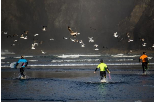
Agate Beach Classic