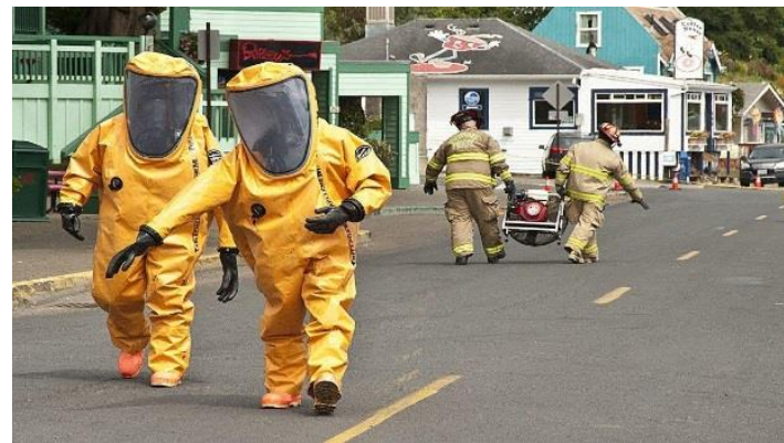
Haz-Mat Spill on Bay Boulevard