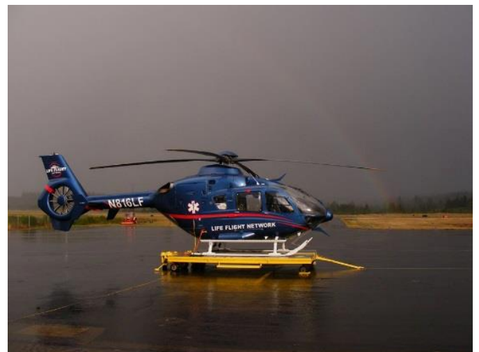
Life Flight based at Airport ONP

Mission Statement: The City of Newport pledges to effectively manage essential community services for the well-being and public safety of residents and visitors. The City will encourage economic diversification, sustainable development, and livability.