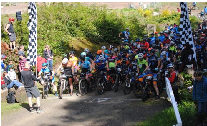
Coast Hills Classic